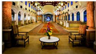
Experience the Spanish Colonial southwest at the accommodations in Coronado Springs Resort, including the dig site pool with a Mayan pyramid, water slide, and 22 person hot tub!

Presented in partnership by: The Commission on Adult Basic Education (COABE) and The ACE of Florida Contact: COABE Conference 2017 Email: info@coabe.org Fax: 866-941-5129 Phone: 888-44-COABE