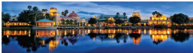
Disney World's Beautiful Coronado Springs Resort

Learn about new best practices and receive targeted training from national level speakers. Twenty three strands--comprised of more than 350 break out sessions--will be offered, providing valuable, state-of-the-art training that you will be able to bring back to your adult ed program! Join more than 2,000 conferees and enjoy numerous networking opportunities with your peers in adult education from around the country!