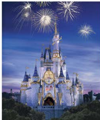
Enjoy food, shopping, and world class rides in any of the 4 Disney World Parks!

DISNEY'S CORONADO SPRINGS RESORT, FLORIDA APRIL 2-5, 2017